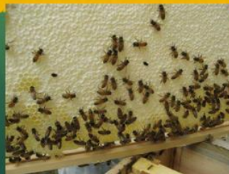
'Helping Beekeepers Keep Bees'