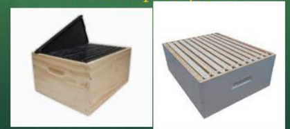
'Helping Beekeepers Keep Bees'