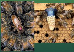
'Helping Beekeepers Keep Bees'