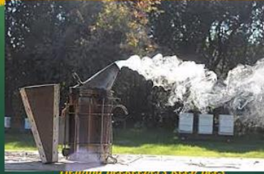
'Helping Beekeepers Keep Bees'