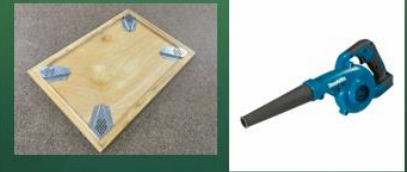
'Helping Beekeepers Keep Bees'