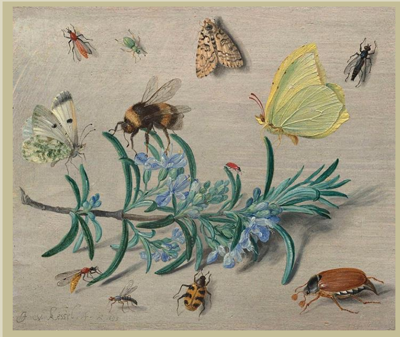
Jan van Kessel the Elder's 'Insects and a Sprig of Rosemary' (1653) Oil on copper, actual dimensions: 11.5 x 14 cm (4 1/2 x 5 1/2 in.)

Preparing for Spring. What we can do in and out of the hive to help get ourselves and the bees ready for Spring